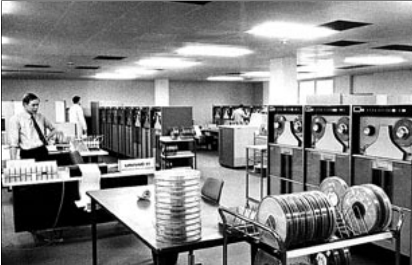
UNIVAC III (1961)

vocabulary knowledge can already be observed after a relatively short period, while it takes longer before an increase in other skills can be observed. Third, tests can focus learners' attention on vocabulary in an attractive way, thus stimulating vocabulary acquisition. I think especially of alternative, informal and less well-known test formats (suggestions can be found in Mondria, 2004, and on Tom Cobb's web site: http://www.lex tutor.ca ). By the way, the very fact that a teacher (regularly) tests vocabulary knowledge is important, as it is a signal to the learners that vocabulary acquisition is essential. Conversely, if a teacher considers sound vocabulary knowledge essential without testing it, the wrong signal is given. In sum, there is every reason for testing vocabulary knowledge separately as well.